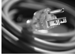
Three prong plug with ground

In an effort to insure the safety and well-being of all Venders, Guest and Staff the National Western Complex strictly adheres to all OSHA rules and regulations. The National Western Complex requires that all Venders comply with all OSHA rules and regulations as well. Fire safety and any preventive measures are one of our top priorities. One area of concern is the use of extension cords and power strips within Vender booths. Under OSHA regulations all extension cords must be a three prong plug with a ground. They must also be properly approved (by Underwriters Laboratory, etc.) OSHA Code of Federal Regulations 29CFR1910.303.